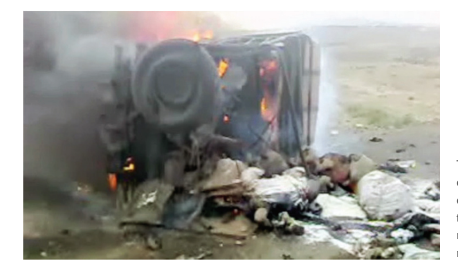
The immediate aftermath of a US airstrike in Sarar on September 2, 2012, that killed 12 civilians returning home from a market.

On September 2, 2012, a Toyota Land Cruiser carrying 14 people was attacked by a warplane or drone near the provincial city of Radaa in central Yemen. The strike by a missile or a bomb killed 12 passengers, including three children and a pregnant woman. A thirteenth passenger and the driver were severely burned but survived.