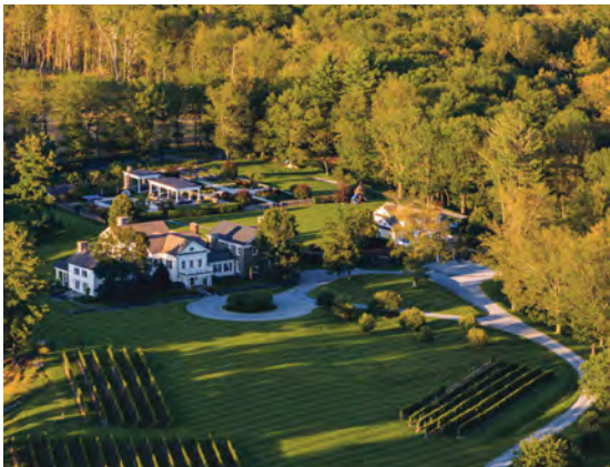
309 Woodstock Road Millbrook, NY $28,000,000 | 7 BD | 7.2 BA | 12,659 SF | 63.46 Acres

thehvteam@compass.com hvteamatcompass.com @ hudsonvalleyatcompass