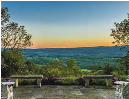
108 Westerly Ridge Drive Amenia, NY $1,249,000