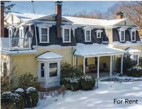
88 Friar Truck Road Ancramdale, NY $25,000 | 5 BD | 3.1 BA | 3,804 SF | 21.50 Acres