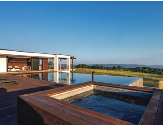
365 Tower Hill Road Wassaic, NY $25,000,000 | 4 BD | 5.3 BA | 9,065 SF | 134 Acres