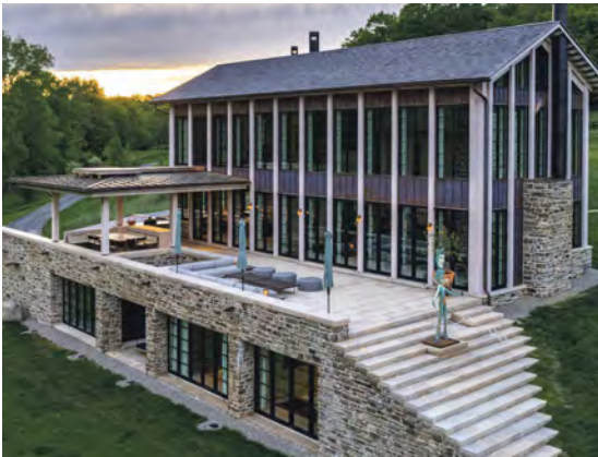
461 Silvernails Road Pine Plains, NY $25,000,000 | 4 BD | 4.1 BA | 7,500 SF | 127.85 Acres