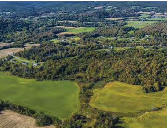
3312 Highway 199 Pine Plains, NY $1,800,000 | 177.5 Acres