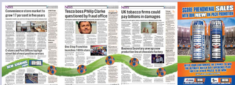
Editorial Weave Across 3 Pages & a Revel Page