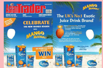
Die Cut Front Cover