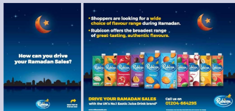
Inside front Cover Gatefold