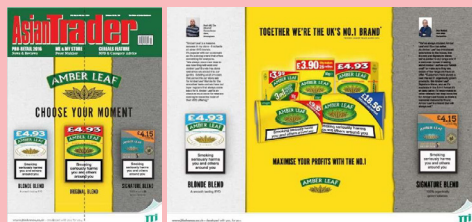
Barn Door Front Cover