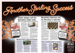
Disruptive Goal Post